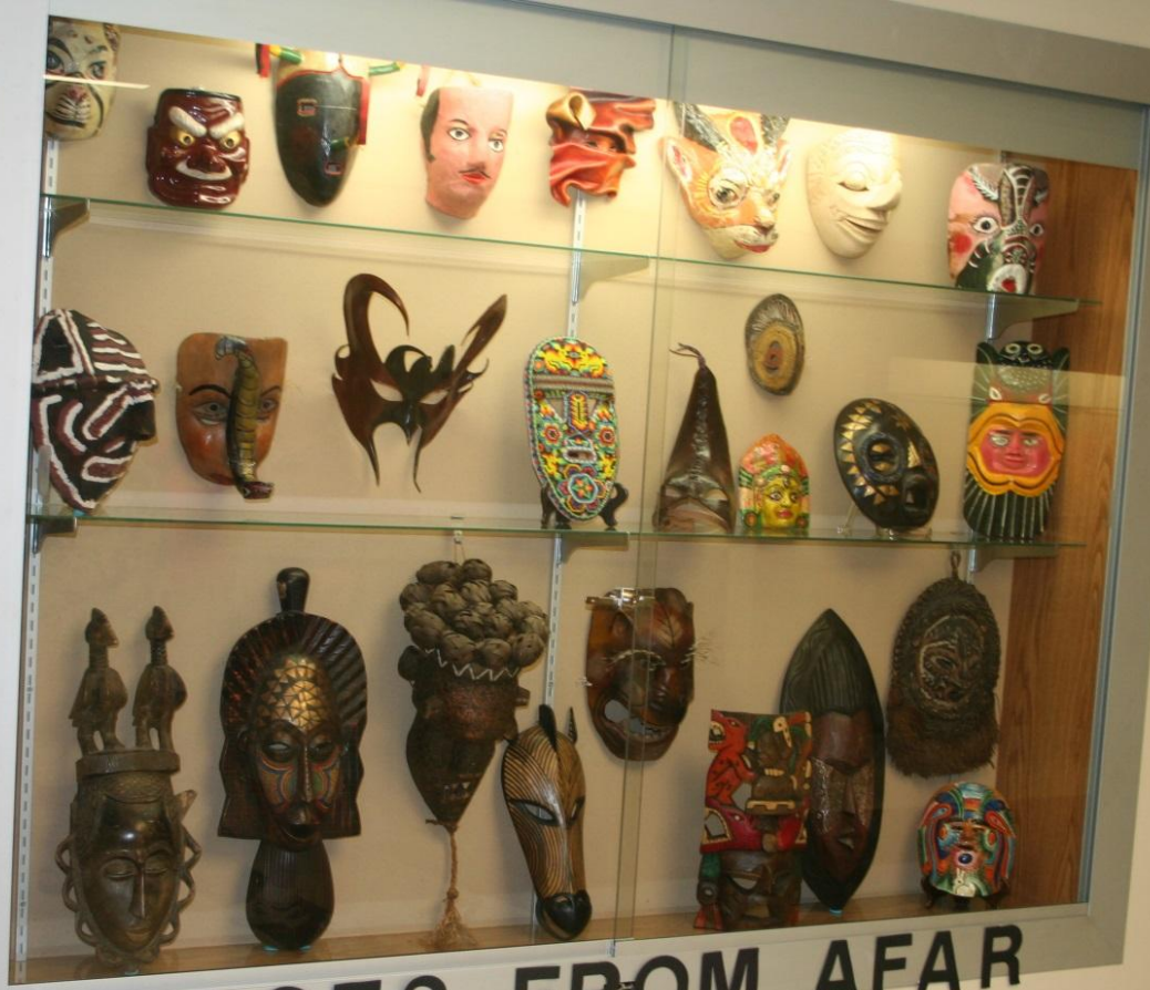
FACES FROM AFAR